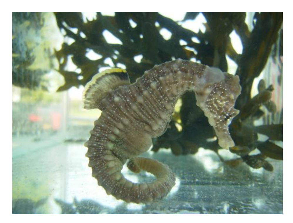
The seahorse's tail is strong, energy efficient and flexible

"We found that the squared-shaped tails are better when both grasping and armour are needed," Dr Porter said.